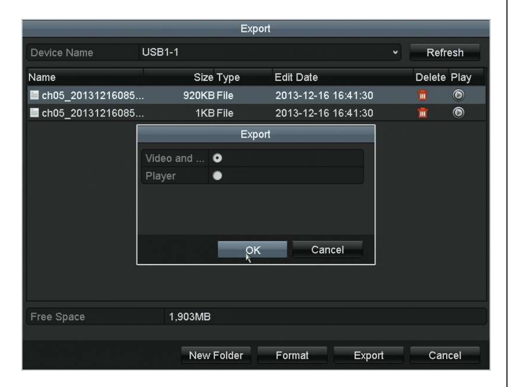
Exporting the Player Program

To export the player software: Click "Export" again > Select "Player" > Click "OK"